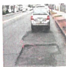
Failed utility cut